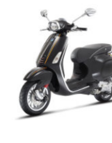
606078M0002 GRAFICHE "SPORT" ANTRACITE/ARANCIO "SPORT" STICKERS DARK GREY/ORANGE