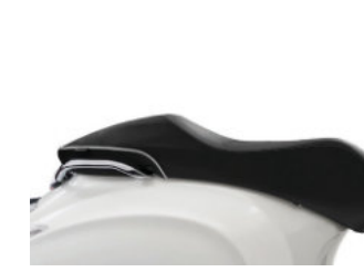
1B001822 SELLA SPORT SPORT SADDLE