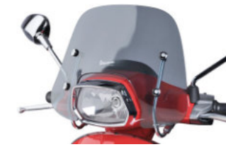
1B001162 CUPOLINO FUMÉ SMOKED FLYSCREEN