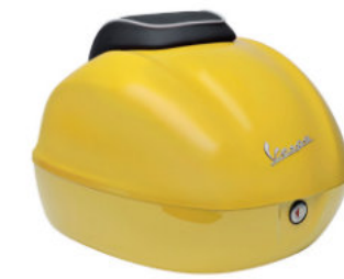
CM272938 GIALLO ESTATE