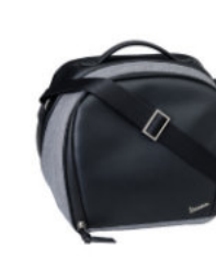
605880M001 BORSA INTERNA BAULETTO TOP BOX INTERNAL BAG