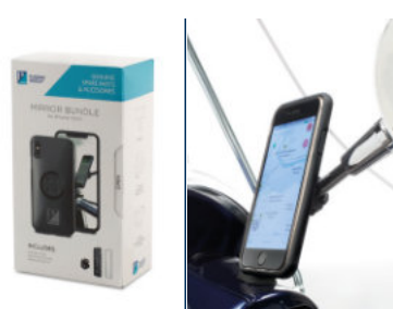
607001M01 IPHONE X/XS 607001M02 IPHONE 8/7/6S/6 607001M03 IPHONE 8/7/6S/6 PLUS 607001M06 UNIVERSALE/UNIVERSAL