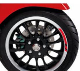
607069M KIT DECAL RUOTA WHEEL DECAL KIT