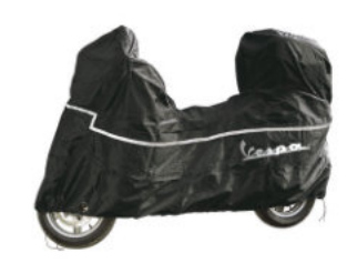
605291M002 TELO COPRIVEICOLO DA ESTERNO OUTDOOR VEHICLE COVER