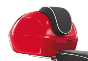
CM273127 VESPA SPRINT SPORT