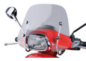
1B001027 CUPOLINO TRASPARENTE TRANSPARENT FLYSCREEN