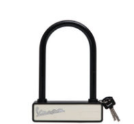
606140M ARCO VESPA VESPA U-LOCK