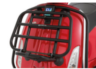
606000M PORTAPACCHI ANTERIORE NERO BLACK FRONT RACK