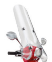
1B001114 PARABREZZA WINDSCREEN