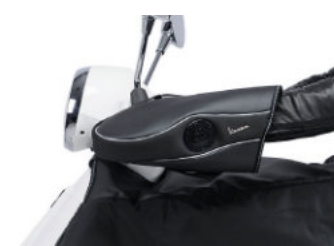
605860M MOFFOLE HANDGRIP MUFFS