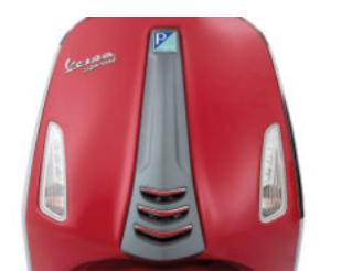
606088M COPRISTERZO GRIGIO OPACO GRIGIO OPACO STEERING COVER