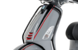
1B001271 PROTEZIONI PERIMETRALI ANTERIORI NERE BLACK FRONT PROTECTION BARS