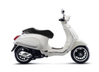
605944M00A GRAFICHE "SPRINT" ARGENTO "SPRINT" STICKERS SILVER