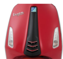
606089M COPRISTERZO NERO OPACO MATT BLACK STEERING COVER