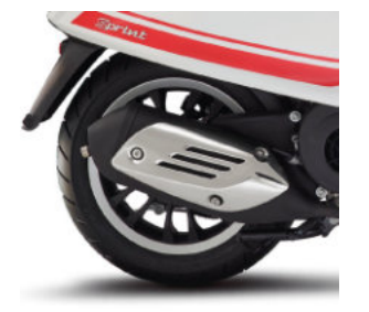
605910M003 CERCHIO POSTERIORE SPRINT (SOLO 2T) REAR RIM SPRINT (ONLY 2T)