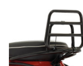
606001M PORTAPACCHI POSTERIORE NERO BLACK REAR RACK