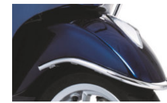
1B001121 PROTEZIONE PARAFANGO CROMATA CHROMED MUDGUARD PROTECTION