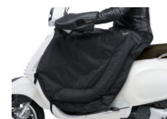
605576M010 TELO COPRIGAMBE LEG COVER