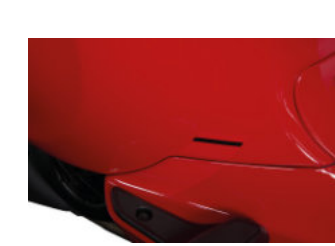
606974M KIT DECAL CARBON CARBON DECAL KIT