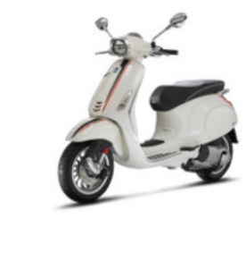
606078M0001 GRAFICHE "SPORT" NERO/ROSSO "SPORT" STICKERS DARK BALCK/ RED