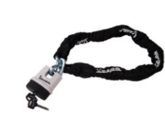
606146M001 CATENA VESPA / VESPA CHAIN (110 CM - 2,61 KG)