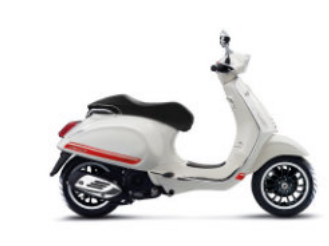
605944M00R GRAFICHE "SPRINT" ROSSO "SPRINT" STICKERS RED