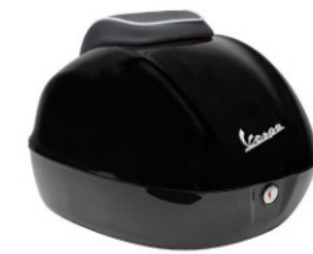
1B0000160090 NERO LUCIDO