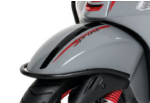
1B001282 PROTEZIONE PARAFANGO NERA BLACK MUDGUARD PROTECTION