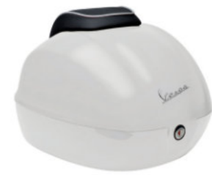
1B00001600BR BIANCO INNOCENZA