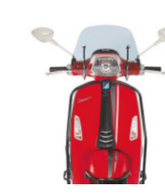
606078M0003 GRAFICHE "SPORT" ANTRACITE/ARGENTO "SPORT" STICKERS DARK GREY/SILVER