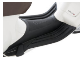
1B001079 TAPPETINO GOMMA RUBBER FOOTMAT