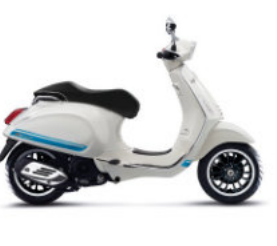
605944M00B GRAFICHE "SPRINT" BLU "SPRINT" STICKERS BLUE