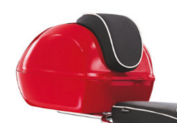
CM273126 VESPA 125/150 ABS E4