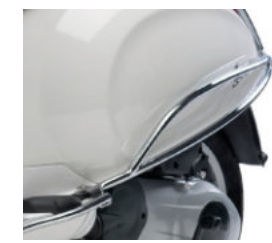
1B000928 PROTEZIONI PERIMETRALI POSTERIORI CROMATE CHROMED REAR PROTECTION BARS