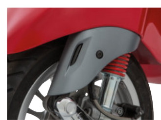
606109M COPRISOSPENSIONE GRIGIO OPACO MATT GREY SUSPENSION COVER