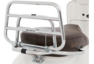
1B000789 PORTAPACCHI POSTERIORE CROMATO CHROMED REAR RACK