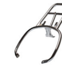
1B000815 SUPPORTO BAULETTO CROMATO TOP BOX CHROMED SUPPORT