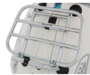
1B000832 PORTAPACCHI ANTERIORE CROMATO CHROMED FRONT RACK