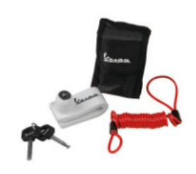
606143M BLOCCADISCO VESPA VESPA DISC BRAKE LOCK