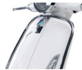
1B000927 PROTEZIONI PERIMETRALI ANTERIORI CROMATE CHROMED FRONT PROTECTION BARS