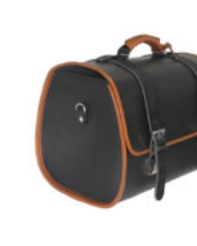
605887M00N BORSA IN VERO CUOIO NERA GENUINE BROWN LEATHER BAG