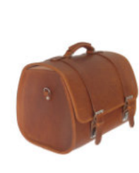
605887M00M BORSA IN VERO CUOIO MARRONE GENUINE BLACK LEATHER BAG