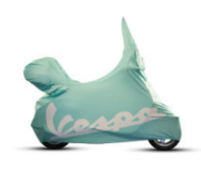
606333M TELO COPRIVEICOLO DA INTERNO INDOOR VEHICLE COVER