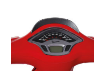
1B006399 CORNICE STRUMENTO CARBON LOOK DASHBOARD COER CARBON LOOK