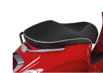
606997M SELLA VESPA SPRINT SPORT ALLURE VESPA SPRINT SPORT ALLURE SADDLE