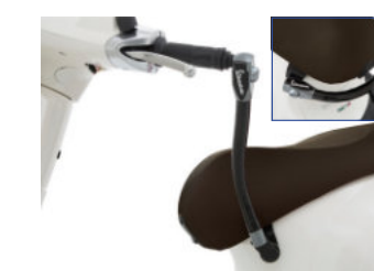
605537M025 ANTIFURTO SELLA-MANUBRIO HANDLEBAR-SADDLE ANTITHEFT