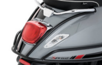
1B001279 PROTEZIONI PERIMETRALI POSTERIORI NERE BLACK REAR PROTECTION BARS