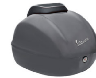
CM272916 GRIGIO TITANIO