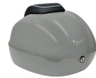
CM272930 GRIGIO MATERIA