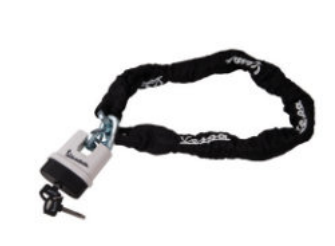
606146M002 CATENA VESPA / VESPA CHAIN (140 CM - 3,20 KG)