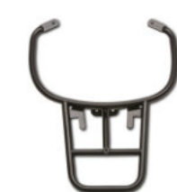
606002M SUPPORTO BAULETTO NERO TOP BOX BLACK SUPPORT