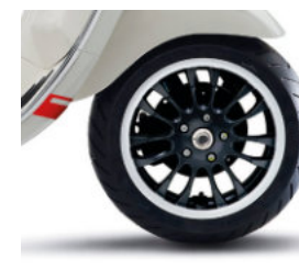
605910M001 CERCHIO ANTERIORE SPRINT SPRINT FRONT RIM