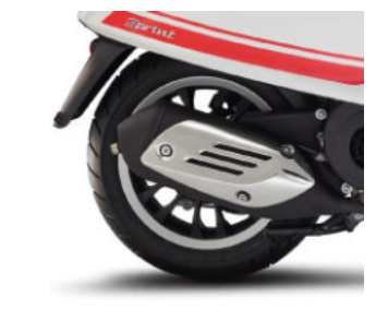
605910M002 CERCHIO POSTERIORE SPRINT (ESCLUSO 2T) REAR RIM SPRINT (NO 2T)