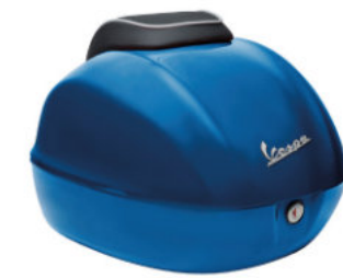
CM272939 BLU VIVACE