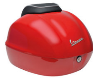
1B00001600R7 ROSSO PASSIONE